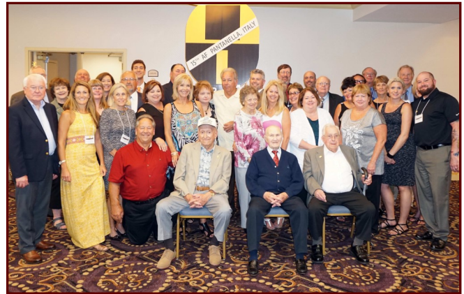
The 464th Bomb Group Attendees at the First Combined Group Reunion