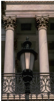
Our Veterans speak to the history of our great nation.

“Veterans and family members... please share your favorite ‘day in the life’ of story for a future 464th BG newsletter”