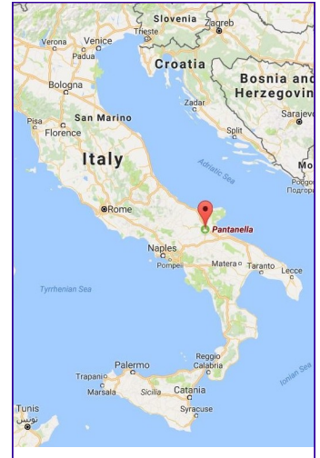
European Theater of Operation, Pantanello Air Field Home of the 15th Air Force 464th & 465th Bomb Groups.