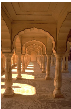
Through the Portals of our many reunions we remember the service to our country.