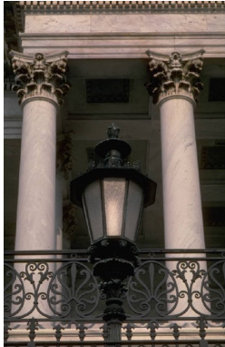
Our Veterans speak to the history or our great nation.