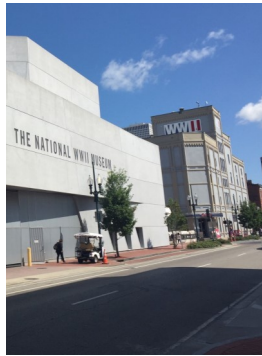
New Orleans World War II Museum 945 Magazine St, New Orleans, LA 70130 (504) 528-1944

“NEWS FLASH the 464th BG website is now up and running once again after a long hiatus”