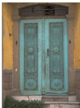
Opening yet another door in the circle of life...

“NEWS FLASH the 464th BG website is now up and running once again after a long hiatus”