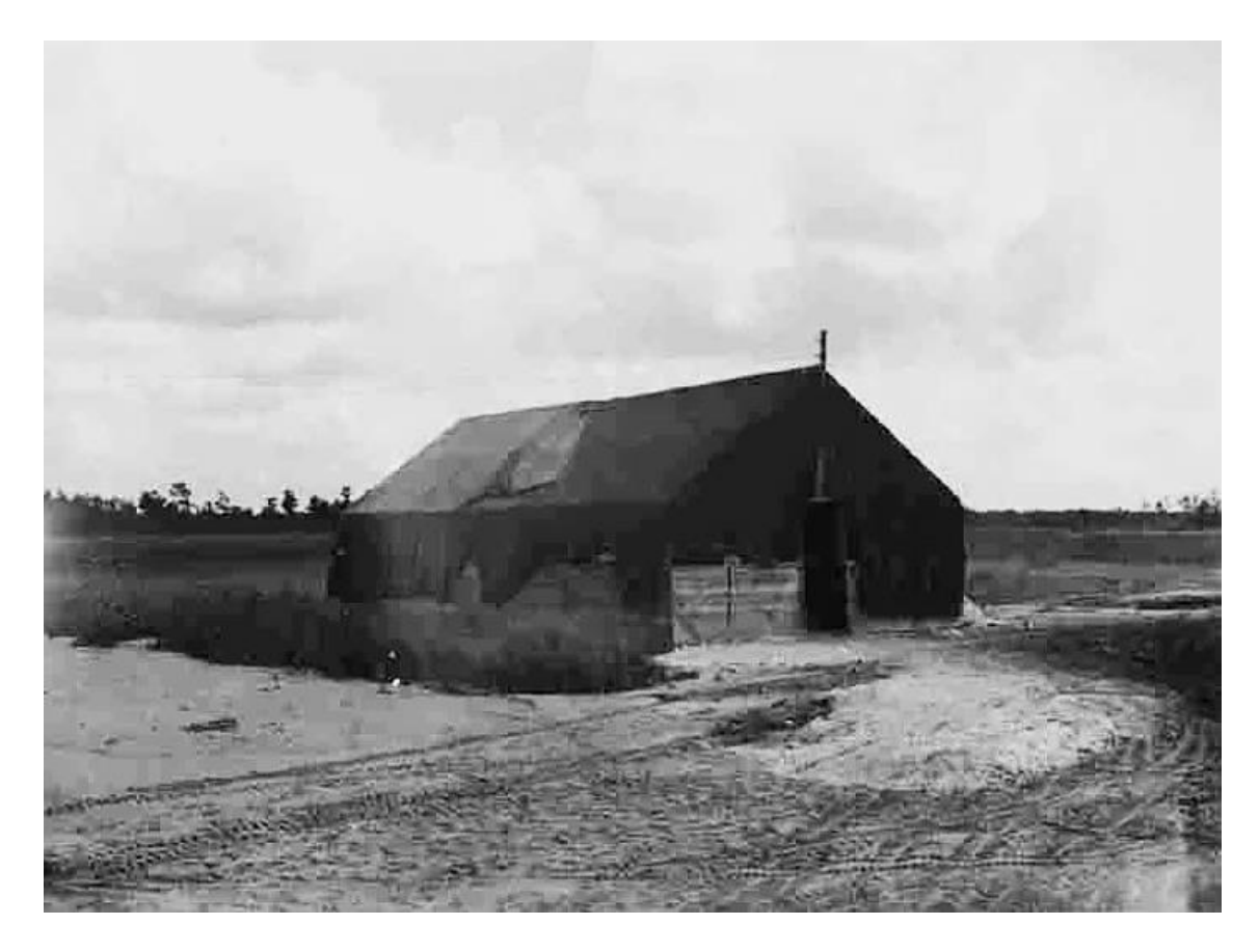
First Group Operations Building, AAB, Pine Castle, Florida, 20 September 43