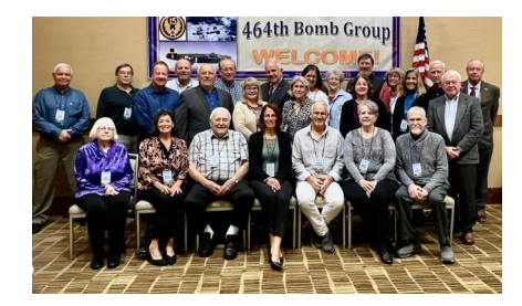
464th Bomb Group Washington reunion attendees gather after Saturday banquet.