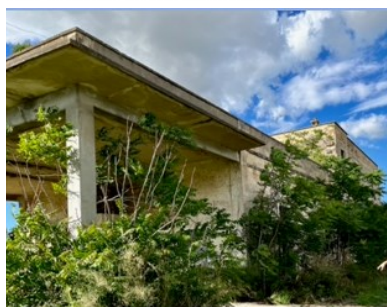
Pantanella Officer's Quarters Today