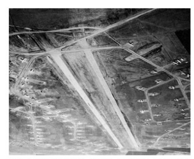
Dual Runways & Hard Stands on Hills