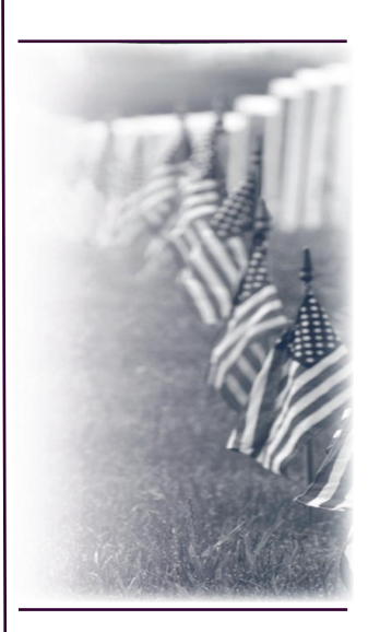
The Missing Man Table

"Flying the Last Sortie... Missing from our ranks but never ever forgotten"