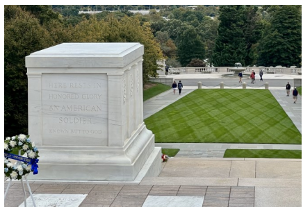
The group toured Arlington National Cemetery stopping at the tomb of the unknown soldier.