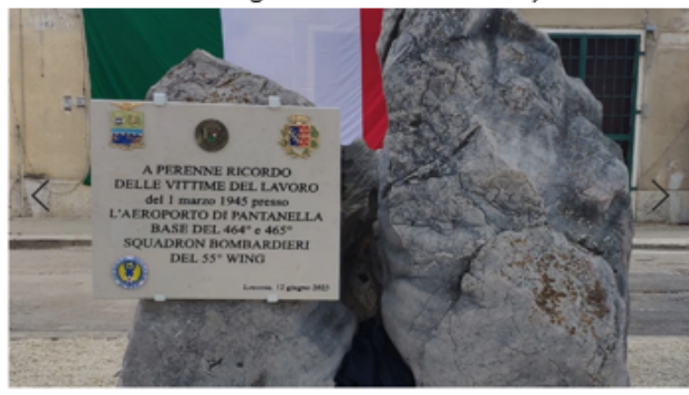
Loconia, Italy permanent marker to airbase