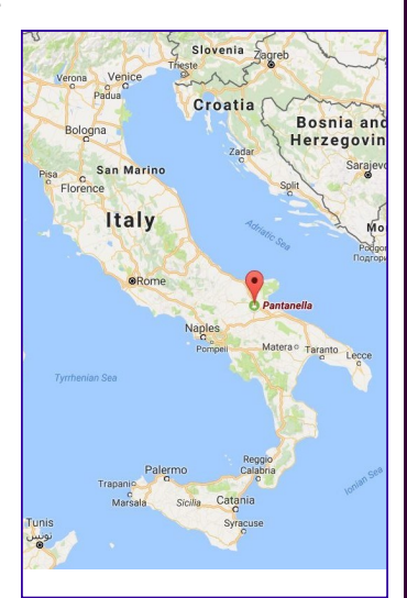
European Theater of Operation, Pantanella Air Field Home of the 15th Air Force 464th & 465th Bomb Groups. Circa 1944—1945