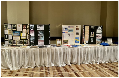
The Washington Westin 464th BG meeting room memorabilia display tables.